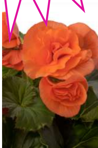
Orange URC Item #: 30003 RC Item #: 40001