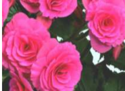
Berseba Barkos Type