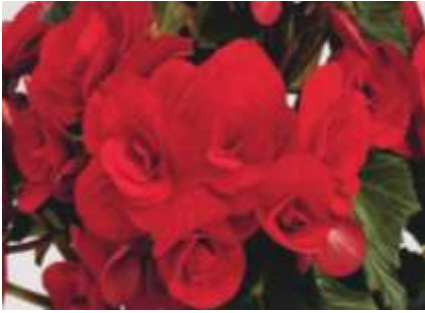
Baladin Barkos Type