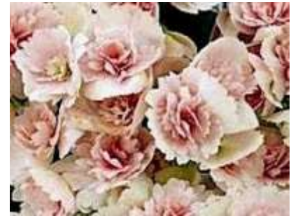
Red Fox® Kristy Fringed Ilona Type