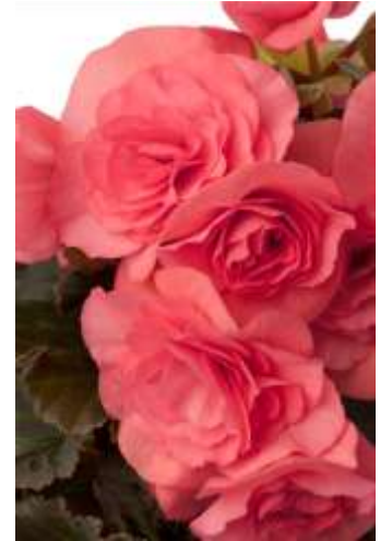
Light Pink URC Item #: 30002 RC Item #: 40006