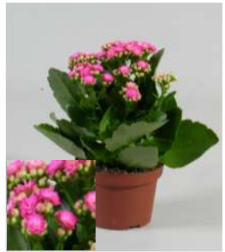
Rosalina Don Angelo URC ITEM # 14031 RC ITEM # 33031