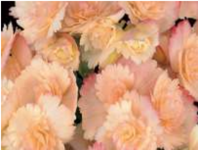
Red Fox® Janny Fringed Ilona Type