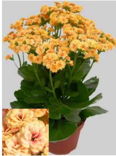
Don Imano URC ITEM # 14024 RC ITEM # 33024