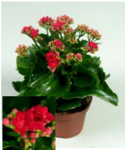
Don Tonio URC ITEM # 14029 RC ITEM # 33029