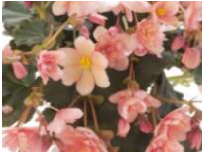
Salmon Cottage Type