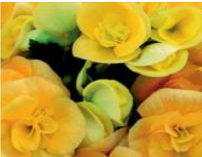
Red Fox® Nadine Ilona Type