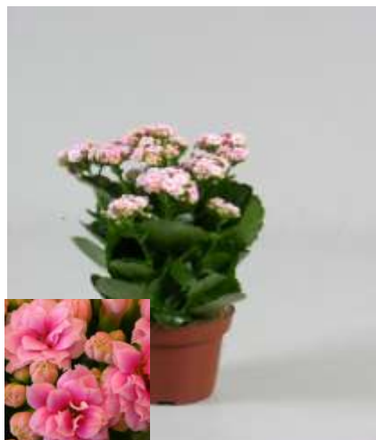
Rosalina Don Darcio URC ITEM # 14032 RC ITEM # 33032