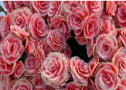
Borias Barkos Type