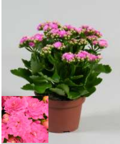
Don Nando URC ITEM # 14027 RC ITEM # 33027