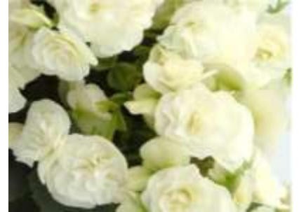
Red Fox® Bonbon White Ilona Type