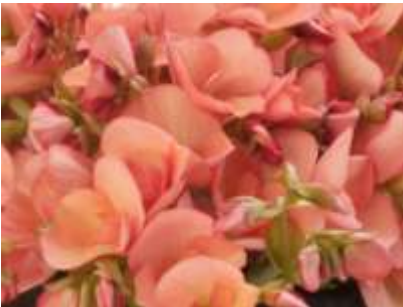
Lax Ilona Type