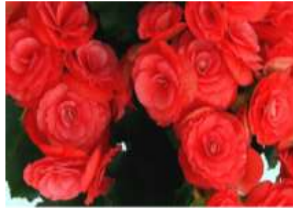
Binos Barkos Type