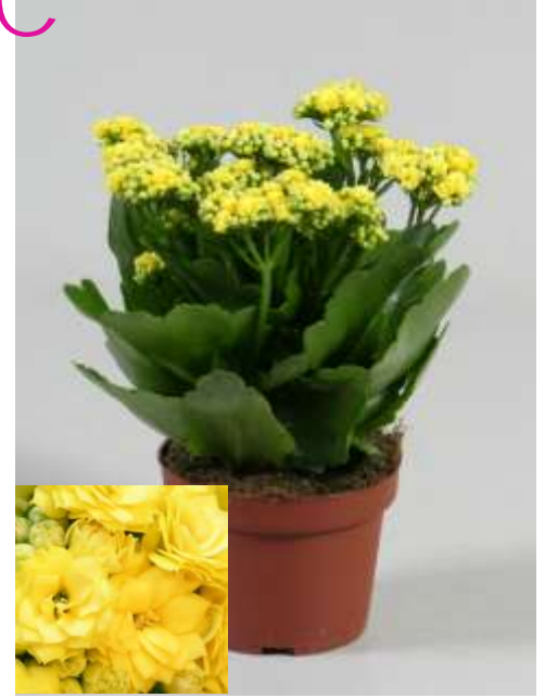
Don Frederico URC ITEM # 14022 RC ITEM # 33022