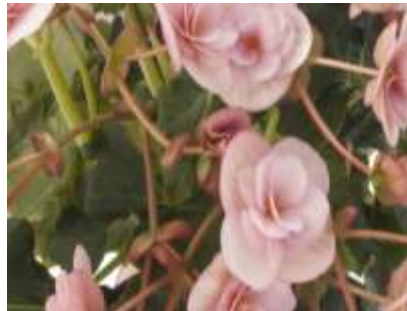
Vintage Pink Cottage Type