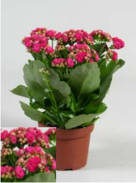
Don Alberto URC ITEM # 14020 RC ITEM # 33020