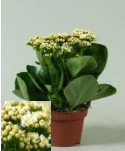
Don Martino URC ITEM # 14026 RC ITEM # 33026