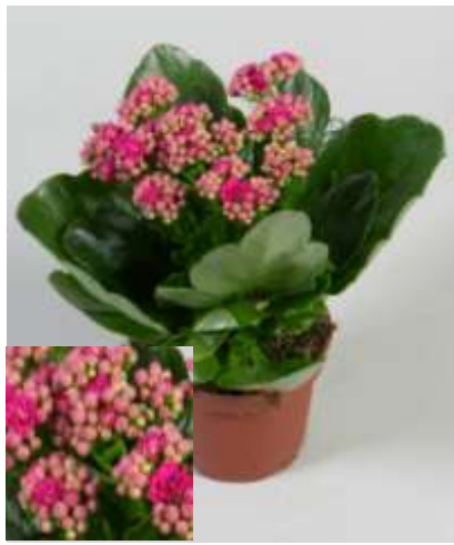
Don Ramon URC ITEM # 14030 RC ITEM # 33030