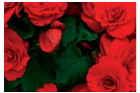
Barkos Barkos Type