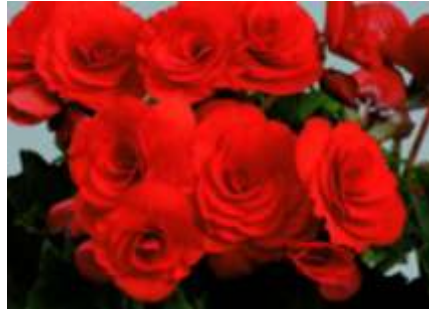
Balamon Barkos Type