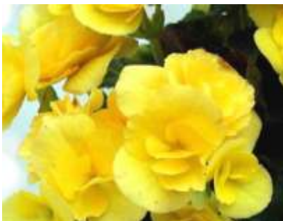
Virunga Volcano Type