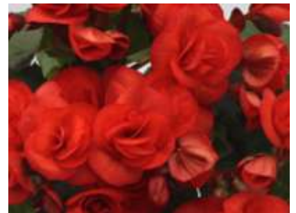
Red Fox® Veronica Ilona Type