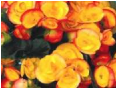
Red Fox® Julie Ilona Type