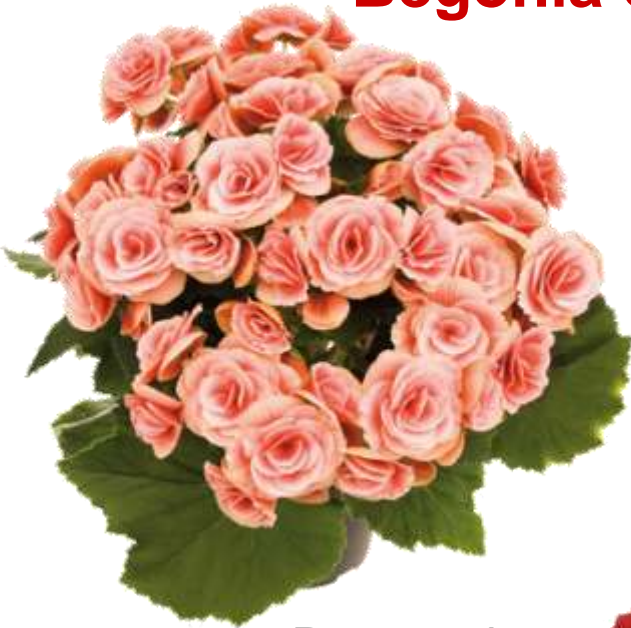
Winter Alias: Peppermint