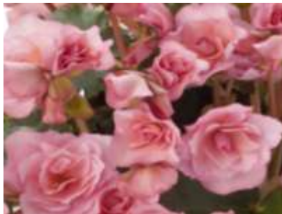
Glory Ilona Type