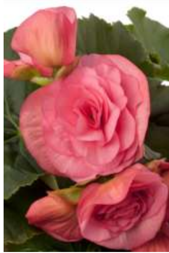
Soft Pink URC Item #: 30022 RC Item #: 40007