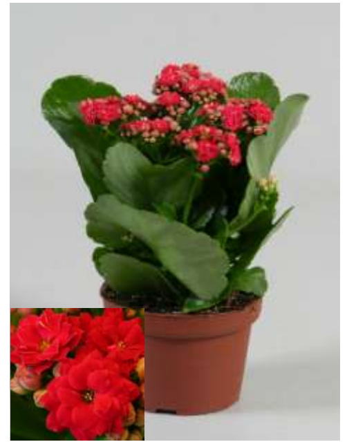
Don Juan URC ITEM # 14025 RC ITEM # 33025