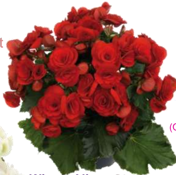
Winter Alias: Christmas Red