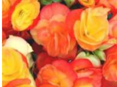
Etna Volcano Type