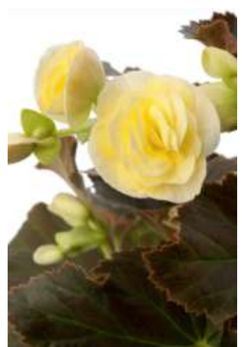
Light Yellow URC Item #: 30016 RC Item #: 40012