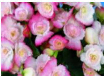
Red Fox® Cindy Fringed Ilona Type