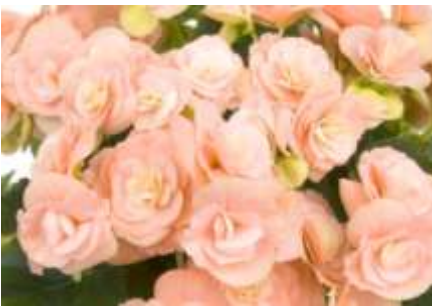
Binos Soft Pink Barkos Type