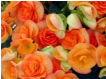
Britt Dark Ilona Type