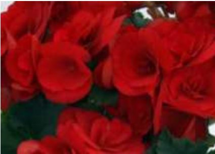
Berseba Red Barkos Type