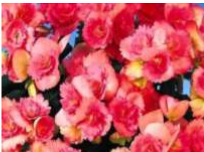
Red Fox® Netja Fringed Ilona Type