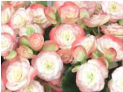
Camilla Ilona Type