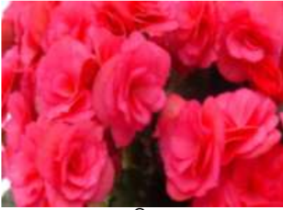
Red Fox® Dragone Ilona Type