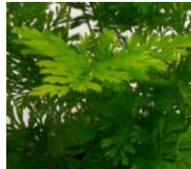
White Rabbit Foot