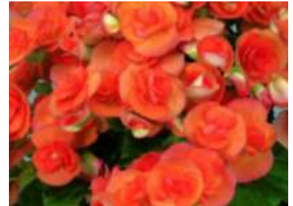
Batik Ilona Type