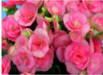
Nelly Ilona Type