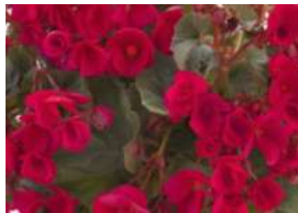
Bright Red Cottage Type