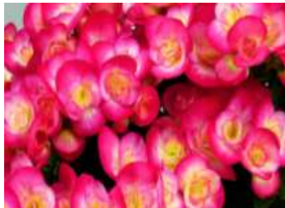
Red Fox® Peggy Ilona Type