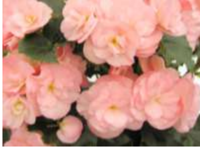
Red Fox® Dragone Champagne Ilona Type