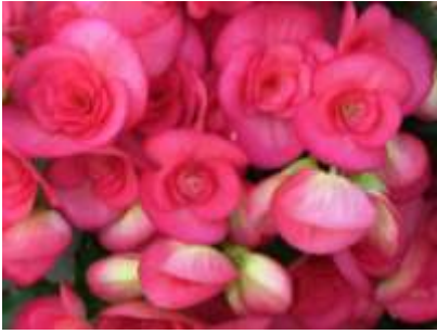
Red Fox® Sandrine Ilona Type