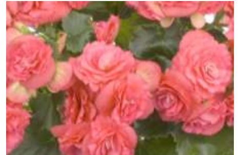
Binos Pink Barkos Type