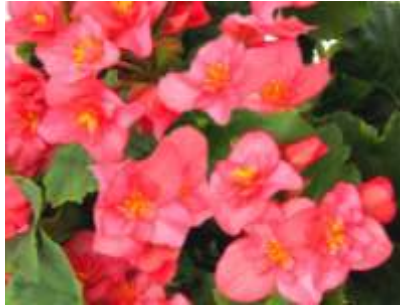
Sweet Dreams Ilona Type