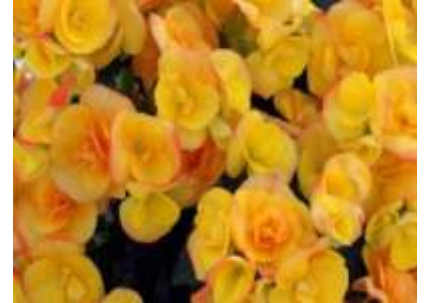
Red Fox® Eva Ilona Type