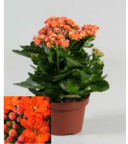
Don Sergio URC ITEM # 14028 RC ITEM # 33028