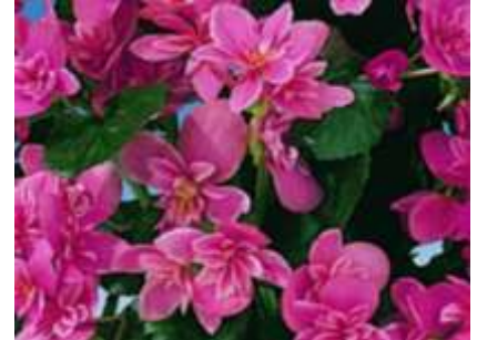
Ceveca Special Type