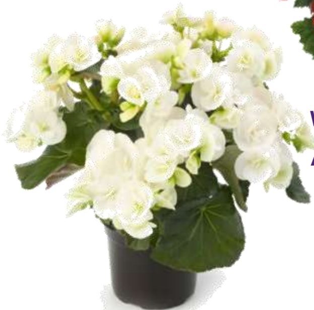
Winter Alias: Winter White