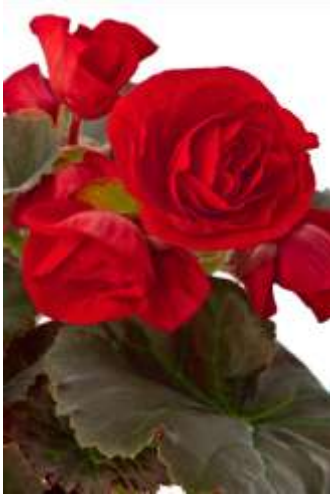
Red Improved URC Item #: 30009