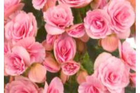
Berseba Light Pink Barkos Type