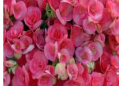
Netja Dark Ilona Type