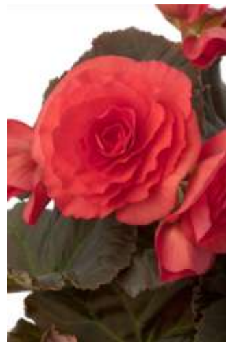
Dark Pink URC Item #: 30001