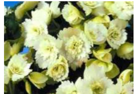
Red Fox® Clara Fringed Ilona Type