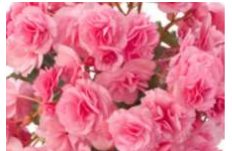
Double Pink Cottage Type