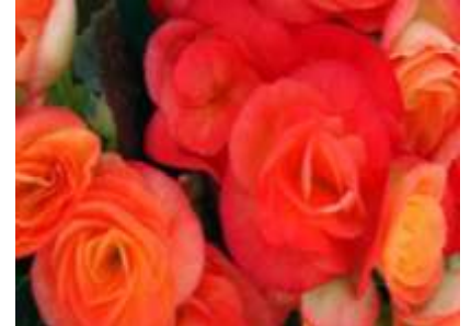
Krakatau Volcano Type