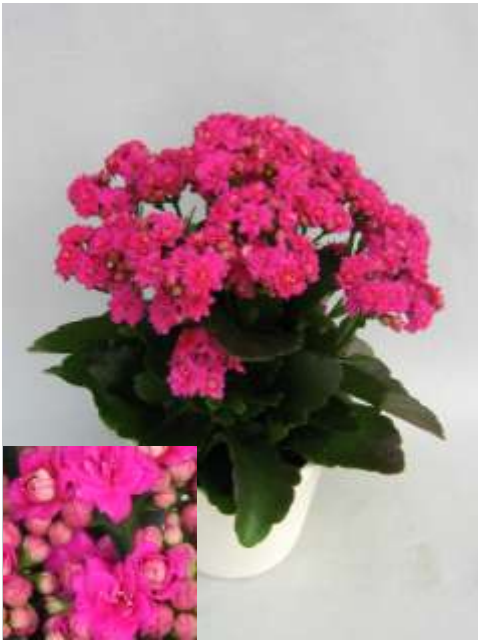
Don Geraldo URC ITEM # 14023 RC ITEM # 33023