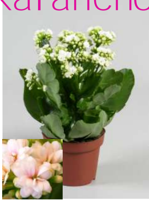
Don Basco URC ITEM # 14021 RC ITEM # 33021