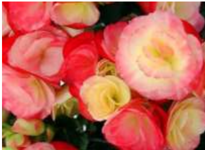
Bromo Volcano Type