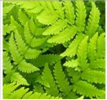
Southern River Wood

LIGHT: Sun to Part Shade HEIGHT: 24-30" (60-75cm) SPACE: 12-18" (30-45cm) apart WATER: Keep well-watered. FERTILIZER: Slow release feed in spring. SOIL: Fertile, humus-rich, well-drained soil. TEMPERATURE: -10°F (-23°C)