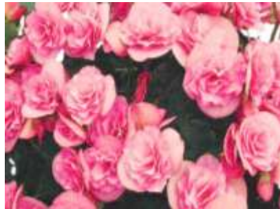
Red Fox® Bon Bon Ilona Type